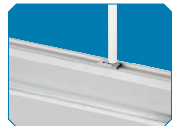
Adjustable height cable mount. Fixed length rigid stem mount.

Consult Individual Product Sheets For Complete Product Specifications and Photometric Information